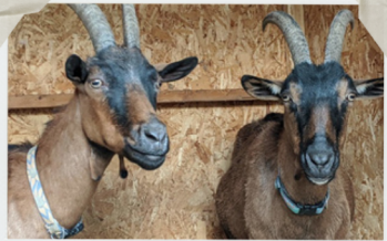
Thelma & Louise