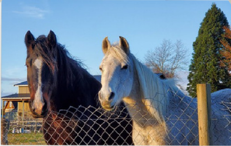
Blackjack & Thumper