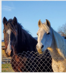
BlackJack & Thumper